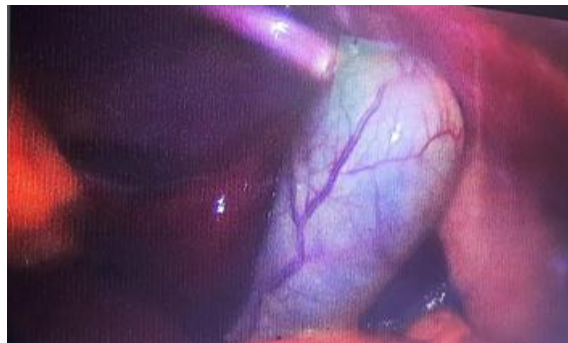
Figure 1: Location of gall bladder to the left of ligamentum teres in situs inversus totalis patient